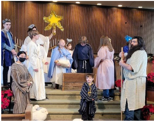
2022 Children's Christmas Play

It's beginning to look a lot like Christmas. In my house this means that the tree is up and the lights are on. We are waiting for a special delivery of Christmas cookies to make their way from Alberta to Windsor, as part of our Christmas celebration is found in the food we eat as well as the songs we sing. For Christmas is a celebration of all of the senses while we count down the days until the time comes for us to once again welcome the child found lying in the manger. Each Sunday we gather together to light the Advent candles and hear anew the story of Mary and Joseph, the shepherds and angels that joyfully proclaim "joy to the world, the Lord has come." We gather to worship with our heads and our hearts, but Christmas is more than just