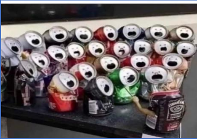
They sing because they can.