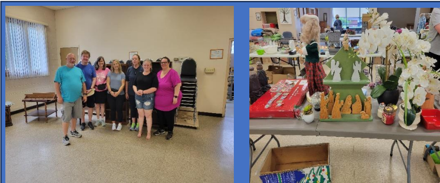
Yard sale volunteers & display

On Sunday, September 24 we are asking everyone to wear an ORANGE T-shirt for Truth & Reconciliation Sunday.